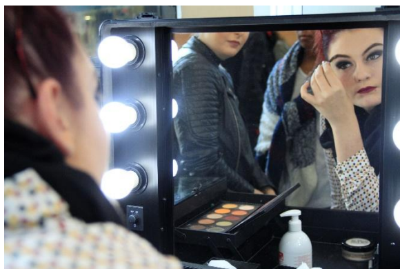
A make-up stand animated by our aesthetics trainees beauty make overs or European flags