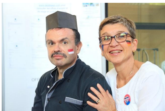
Erasmustudio : photography stand where learners and SEPR staff had pictures taken with accessories (fancy dresses, funny hats...) followed by the best photo contest!