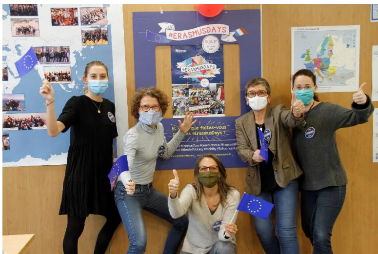
Information stand on mobility opportunities abroad