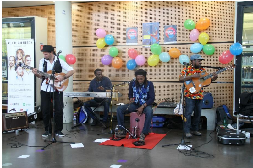
A Jazz concert

For this occasion the SEPR Centre organized an important event, including :