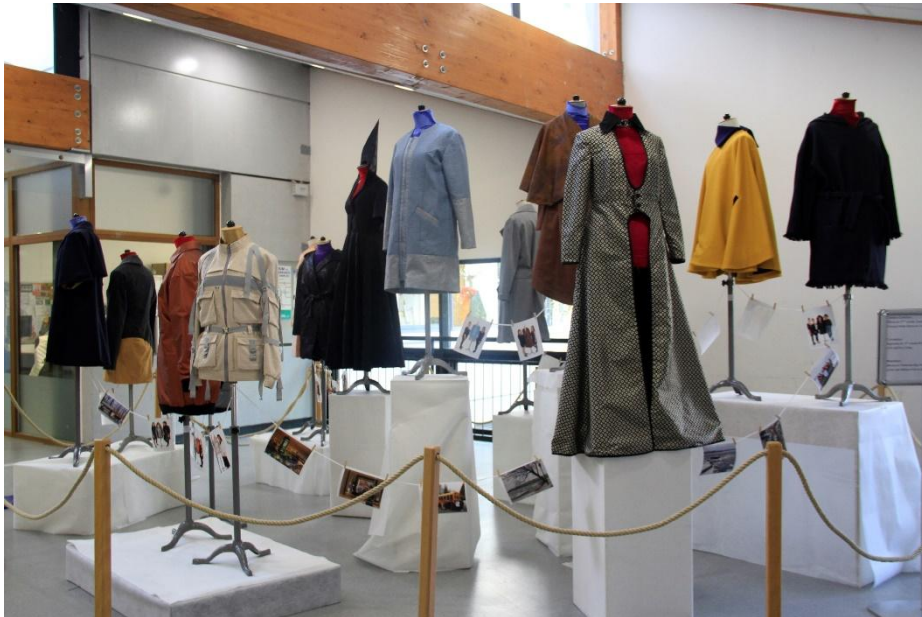
Winter coats made during an exchange with a partner school in Quebec.

Exhibitions of productions made during international exchanges with our partner schools.