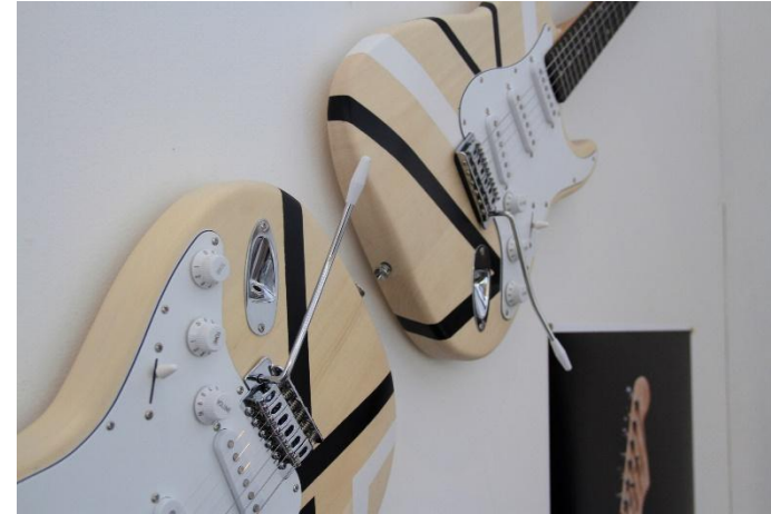
Wooden electric guitars made during an exchange with a Finnish partner school. Work done in Franco-Finnish pairs.