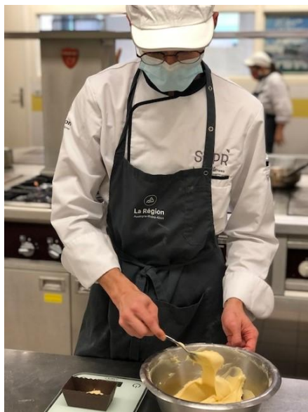
European menus in the cafeteria

Various sectors of the SEPR Centre involved each year in the organization of this international week