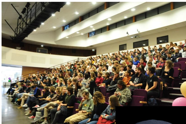
Theater performance in English by an Italian troupe on themes as varied as Brexit or cyber-bullying.