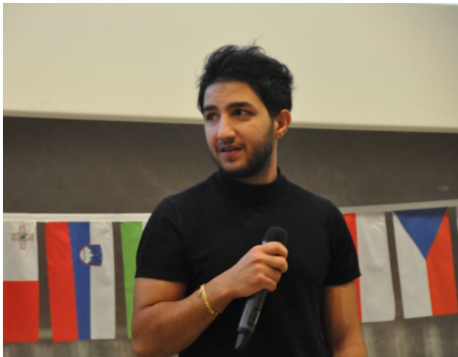
Testimonials of learners who have gone abroad

On the occasion of Erasmus Days, the SEPR Centre organizes every year since 2017, a week of events around international mobility.